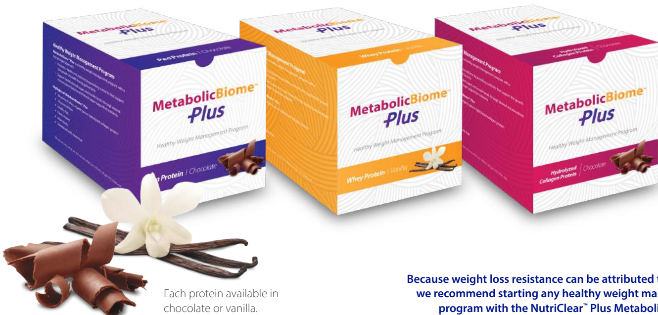
Each protein available in chocolate or vanilla.

Because weight loss resistance can be attributed to toxicity, we recommend starting any healthy weight management program with the NutriClear™ Plus Metabolic Cleanse.