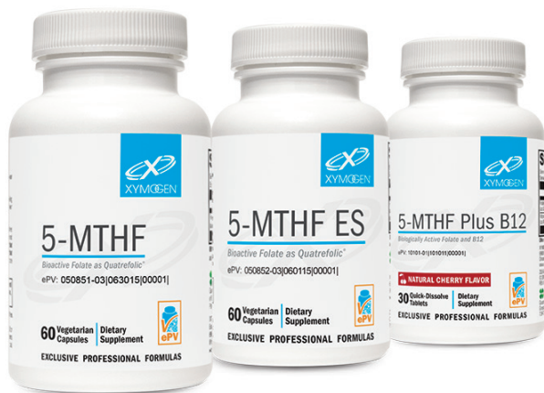
5-MTHF and 5-MTHF ES are available in 60 capsules 5-MTHF Plus B12 is available in 30 quick-dissolve tablets