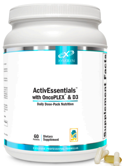
Available in 60 packets