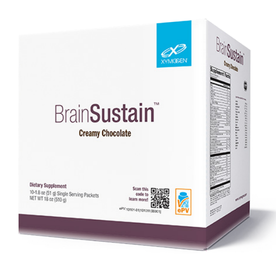
Available in Creamy Chocolate and Vanilla Delight BrainSustain™ for Kids is available in Vanilla Delight