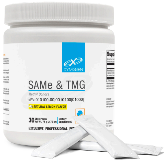
Available in 30 Stick Packs